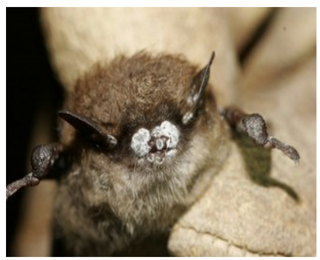
Brown Bat with WNS

Since 2007, when white-nose syndrome (WNS) was first seen in hibernating cave bats near Albany, NY, most nearby caves were closed in an attempt to limit spread of the disease later found to be caused by a fungus (now identified as Pseudo-gymnoascus destructans ). However, the disease continued to spread across most of North America, killing millions of insect-eating bats. See <a href="https://www.whitenosesyndrome.org/">https://www.whitenosesyndrome.org/</a> for specifics about WNS and its ecological impacts. Unfortunately, with absence of active caving opportunities, few beginner cavers have joined the fellowship in recent years.