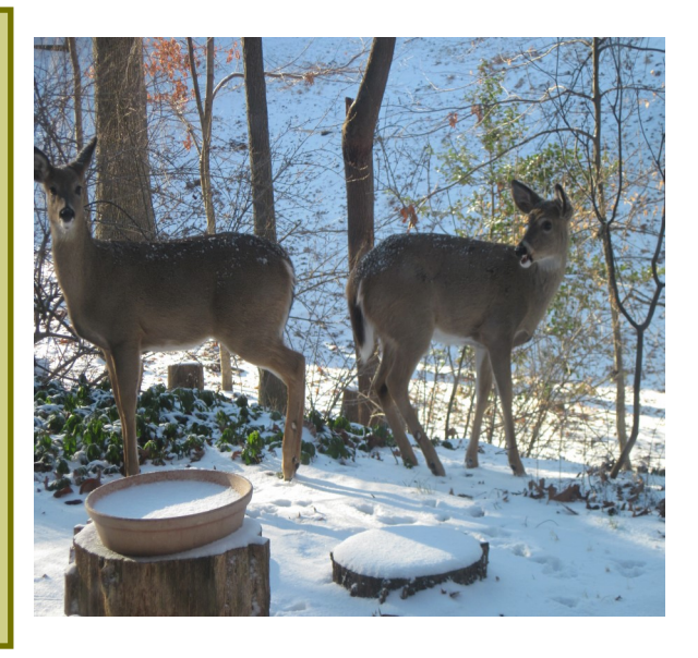
The DuFief Pond

Note: For the homeowners who do not have email, the Readwood was printed at cost as a community service by Alpha Graphics Shady Grove in Gaithersburg (agshadygrove.com).