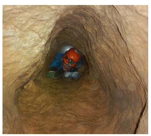
A Tight Crawl

Doug and I continued to cave until COVID-19 arrived, when group physical activities precluded retreats into underworlds. We do have a rope rigged in a side yard tree to periodically keep our climbing skills honed. When travel opportunities rebound, we have a list of publicly and pri-