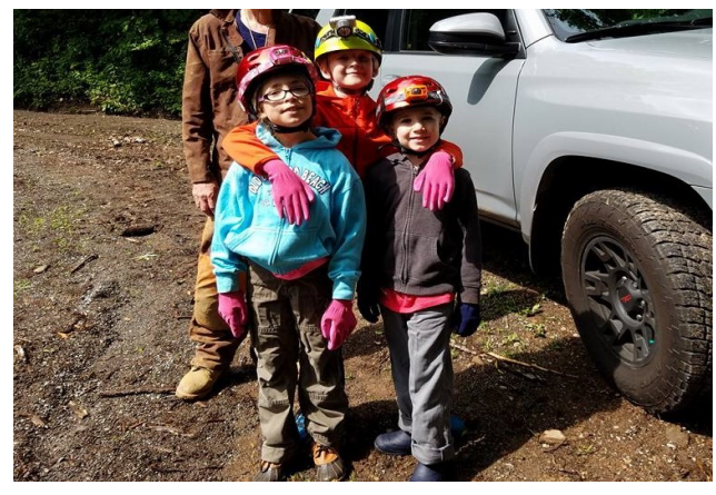
The Grandkids Ready for Caving

Our spring-summer-fall is usually packed with caving activities: attending regional and national meetups in caving-rich venues, taking grandkids for Adventure Week with caving, hiking, tubing, rafting. The grandkids love the caving adventures, just like their parents before. Our caving started 25 years ago in DuFief when the local Boy Scout troop asked for volunteer parents for a cave outing. (Yes, there are caves relatively nearby.) It was a surreal experience, with crawling, climbing, sloshing through an underground stream, and with even a few pretties, e.g., calcite crystals, speleothems.