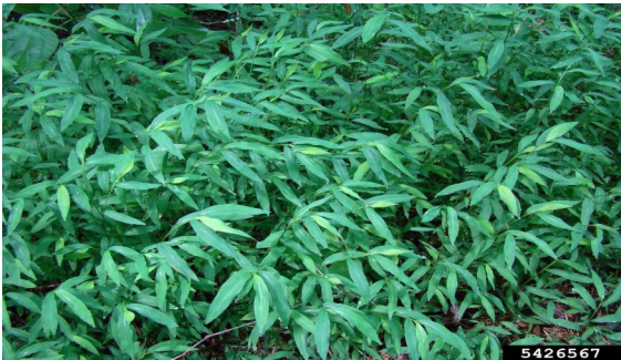
Japanese Stilt Grass

To control it, pull it out as soon as you see it and put it in your yard waste bin. Don't let it go to seed.