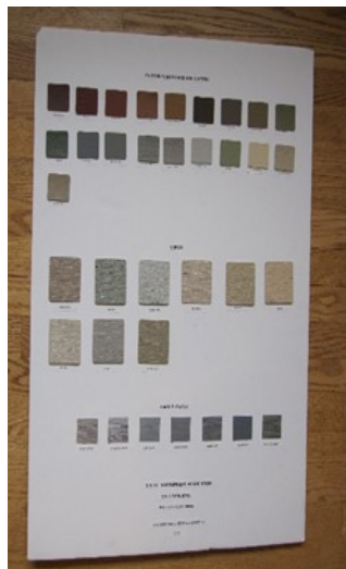
Figure 2: Siding Colors