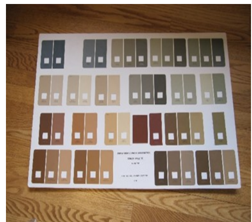
Figure 3: House Trim Colors

Before doing exterior work to your home, please go to