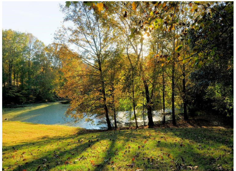
The DuFief Pond

Note: For the homeowners who do not have email, the Readwood was printed at cost as a community service by Alpha Graphics Shady Grove in Gaithersburg ( agshadygrove.com ).